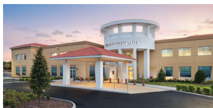
Orlando Health Medical Pavilion - Summerport 5151 Winter Garden Vineland Rd. Windermere, FL 34786

This facility offers comprehensive medical services including primary and specialty care for adults and children, obstetrics and gynecology, surgery and outpatient laboratory services. An imaging center is scheduled to open by summer 2020.