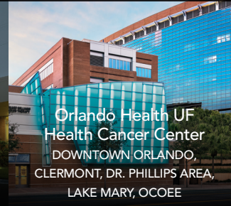
Orlando Health UF Health Cancer Center DOWNTOWN ORLANDO, CLERMONT, DR. PHILLIPS AREA, LAKE MARY, OCOEE