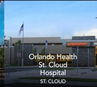
Orlando Health St. Cloud Hospital ST. CLOUD