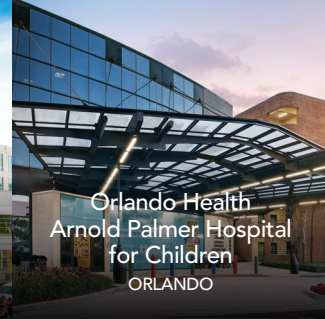
Orlando Health Arnold Palmer Hospital for Children ORLANDO