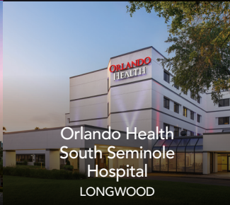
Orlando Health South Seminole Hospital LONGWOOD