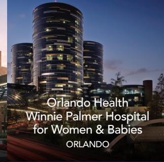
Orlando Health Winnie Palmer Hospital for Women & Babies ORLANDO