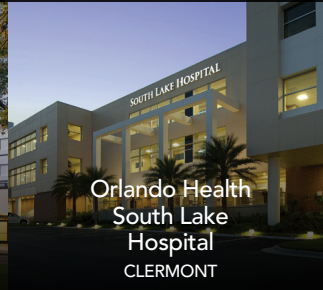
Orlando Health South Lake Hospital CLERMONT