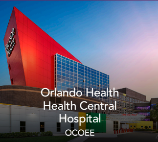
Orlando Health Health Central Hospital OCOE