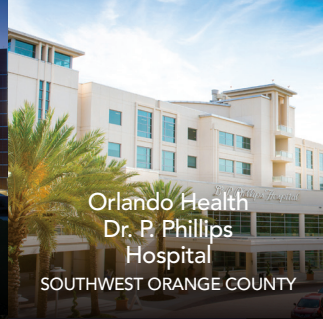
Orlando Health Dr. P. Phillips Hospital SOUTHWEST ORANGE COUNTY