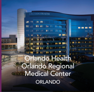
Orlando Health Orlando Regional Medical Center ORLANDO